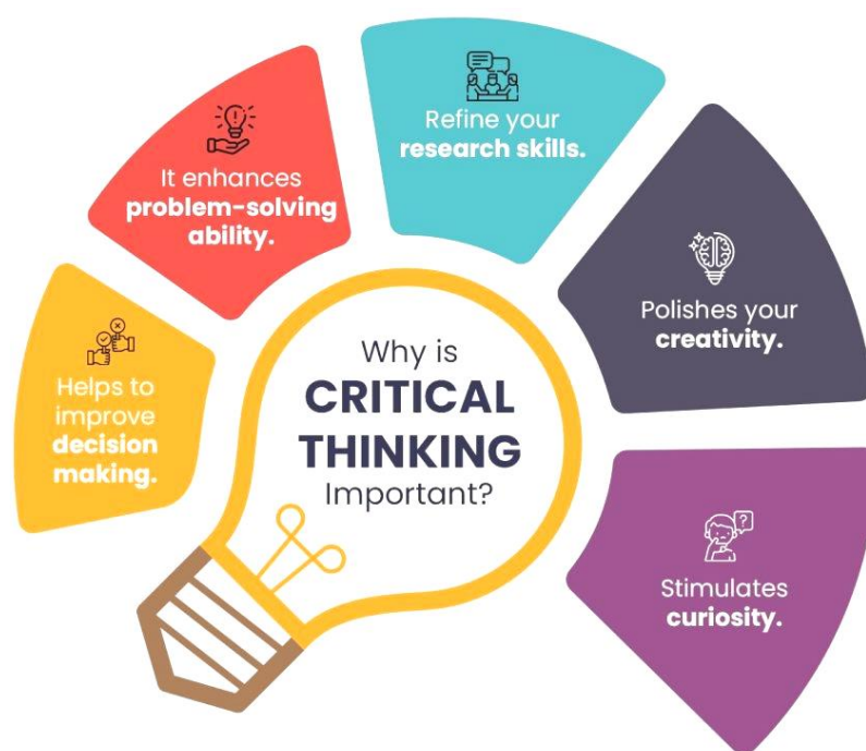
Figure 1. The Benefits of Critical Thinking & How to develop it ( https://tscfm.org/blogs/the-benefits-of-critical-thinking-for-students/ , 2023)

Critical thinking shows that we all operate under certain conditions of uncertainty, limited rationality –